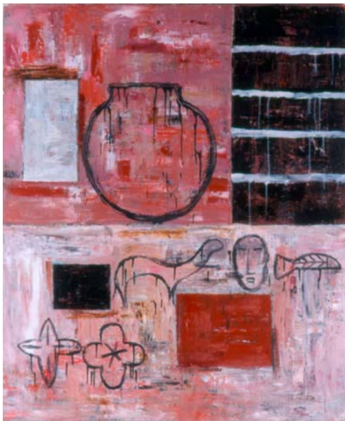
Salish Spring (Montana Memories Series), oil, wax on canvas, 1988-89, 60.25 x 50”.

collections of contemporary Native American art in the United States, including thirty-six of Smith’s paintings and prints.