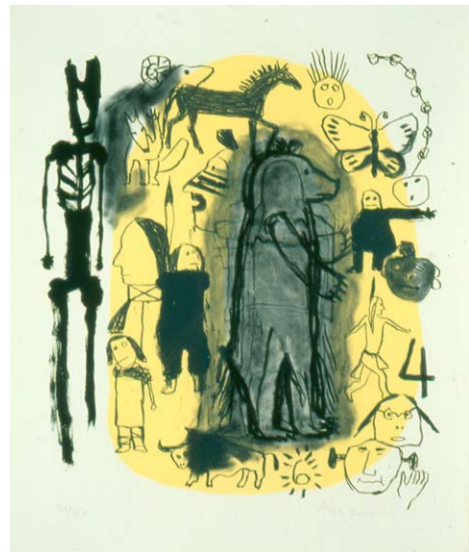
Sticky Mouth , lithograph, 1997, 21.5 x 19"