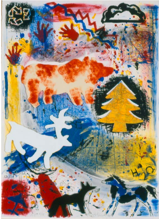
Ode to Chief Seattle , lithograph, ca. 1991, 30 x 22.25"

Museum of American Art, New York; the National Museum of American Art, Washington, DC; the Walker Art Center, Minneapolis; the Heard Museum, Phoenix; the Denver Art Museum; The Albuquerque Museum of Art; the Museum of Fine Arts in Santa Fe; in addition to a host of university and college museums.